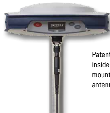
Patented inside-the-rod mounted UHF antenna design